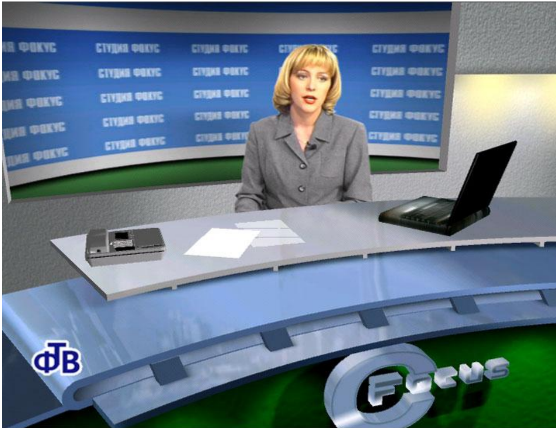
Figure 1. An example of a Focus virtual studio when in use.

The Focus system is oriented, first of regional, cable, Internet studios or television company divisions. As a virtual studio it allows you to organize production of a set of programs (news, weather forecast, entertainment programs) or other video production (video clips, etc.) using only one small studio without real scenery, light and television technique requirements being very small. At that, the visual quality of the production made can differ extremely little from the production of the world leading TV companies. An example of a product created using the Focus system is shown in Figure 1. An example of a Focus virtual studio when in use.